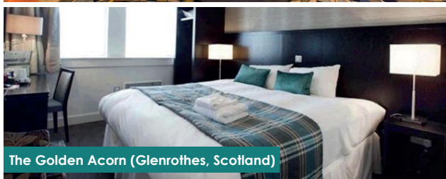
The Golden Acorn (Glenrothes, Scotland)