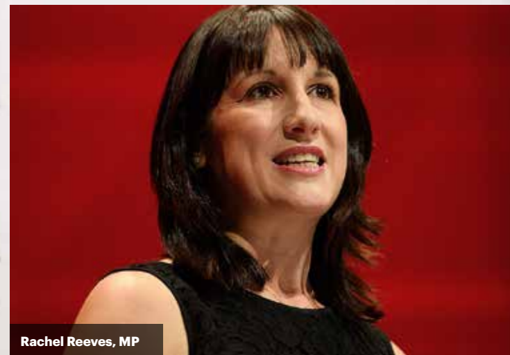
Rachel Reeves, MP