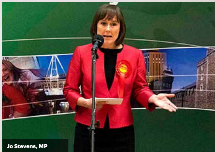
Jo Stevens, MP

Editor's note: Tim Martin explains how he wrote to Rachel Reeves MP to complain about Jo Stevens MP's invention of a fictitious appearance in front of Ms Reeves' BEIS Committee and about other matters.