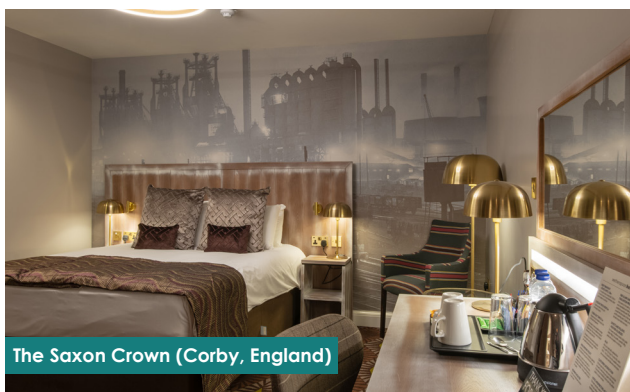
The Saxon Crown (Corby, England)

jdwetherspoon.com or the Wetherspoon app