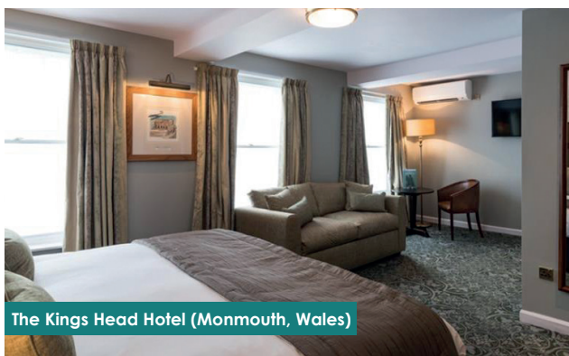
The Kings Head Hotel (Monmouth, Wales)