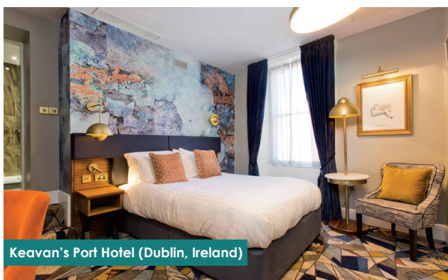
Keavan's Port Hotel (Dublin, Ireland)